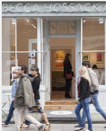
REBECCA HOSSACK GALLERY, 28 CHARLOTTE STREET, W1