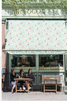
MR FOGGS, 48 NEWMAN STREET, W1