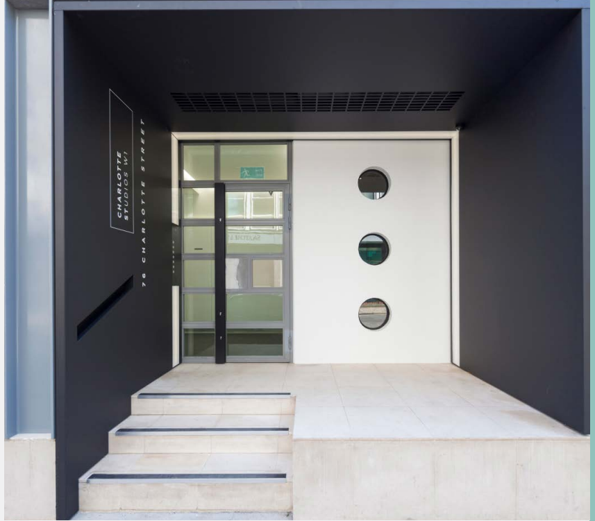
Charlotte Studios entrance

THESE FULLY FITTED AND READY TO GO FLOORS WILL PROVIDE A UNIQUE AND DESIRABLE WORKING ENVIRONMENT FOR ANY ASPIRING BUSINESS.