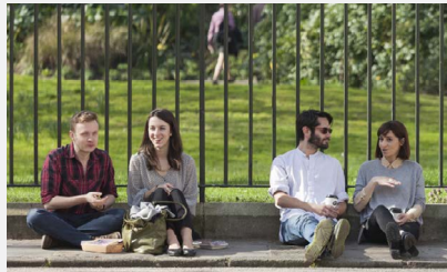
FITZROY SQUARE, W1