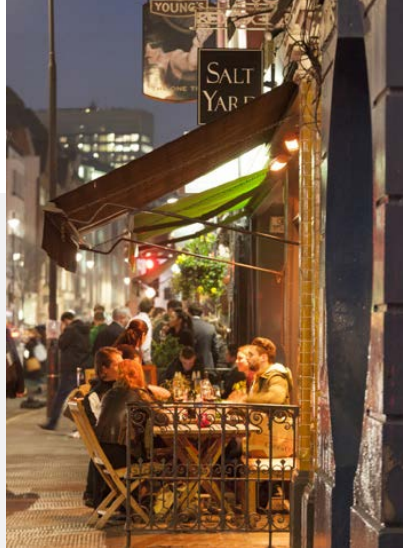
SALT YARD, 54 GOUDGE STREET, W1