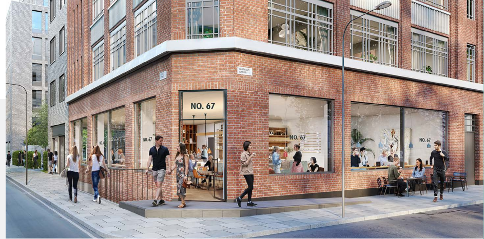
67 Whitfield Street proposed café

DERWENT LONDON ARE PROUD TO CALL FITZROVIA ONE OF THEIR KEY VILLAGES WITH 1.4M SQ FT OF OFFICE AND RETAIL SPACE. THIS MEANS THAT WE CAN OFFER ANY LOCAL COMPANY THE OPPORTUNITY TO HAVE THEIR OFFICE NEEDS MET AS THEIR BUSINESS NEEDS CHANGE.