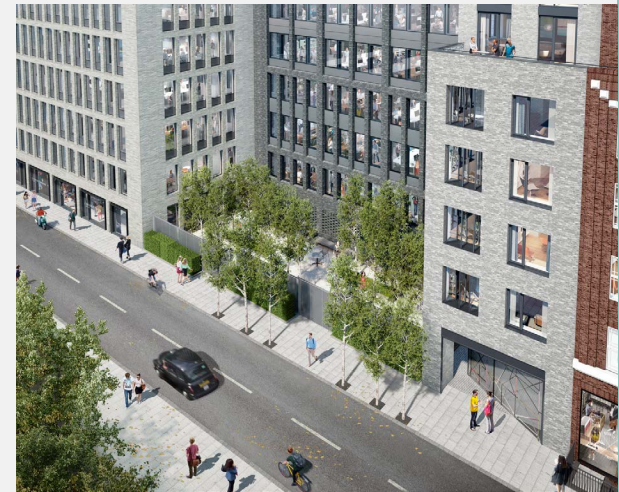
Poet's Park - Chitty Street