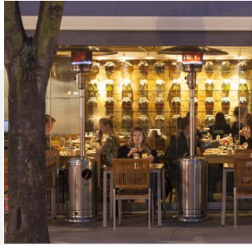
ROKA, 37 CHARLOTTE STREET, W1

THIS HISTORIC ARTISAN DISTRICT BRINGS ITS ECLECTIC STORY TO THE FORE WITH A MIX OF ARCHITECTURAL STYLES, WIDE STREETS MINGLING WITH COSY SIDE ALLEYS AND AN ABUNDANCE OF HIDDEN BAR AND RESTAURANT GEMS.