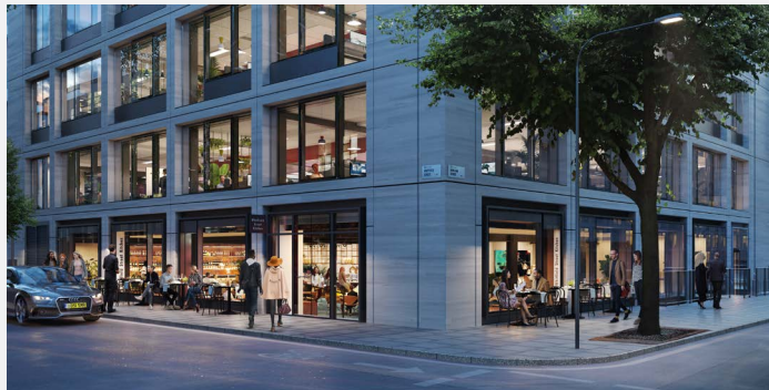
89 Whitfield Street proposed restaurant

THIS IS OUR LATEST DEVELOPMENT, ADJACENT TO 76 CHARLOTTE STREET. IT WILL OFFER TWO NEW EXCITING RETAIL/ RESTAURANT UNITS AND THE NEW POET'S PARK, AN URBAN OASIS FOR CENTRAL LONDON, RIGHT ON YOUR DOORSTEP.