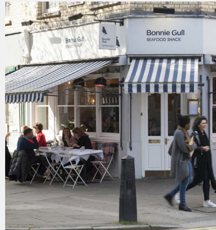
BONNIE GULL SEAFOOD SHACK, 21A FOLEY STREET, W1