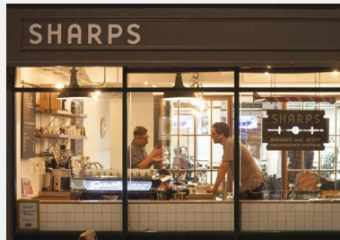
SHARPS, 9 WINDMILL STREET, W1

THIS HISTORIC ARTISAN DISTRICT BRINGS ITS ECLECTIC STORY TO THE FORE WITH A MIX OF ARCHITECTURAL STYLES, WIDE STREETS MINGLING WITH COSY SIDE ALLEYS AND AN ABUNDANCE OF HIDDEN BAR AND RESTAURANT GEMS.