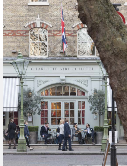
CHARLOTTE STREET HOTEL, 15-17 CHARLOTTE STREET, W1