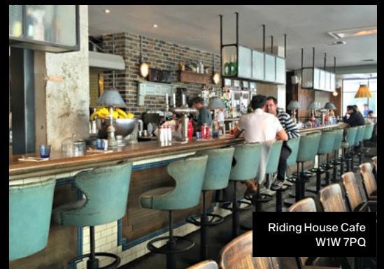
Riding House Cafe W1W 7PQ

Misrepresentation Act. The particulars contained in this brochure are believed to be correct, but cannot be guaranteed. All liability, in negligence or otherwise, for any loss arising from the use of these particulars is hereby excluded. All floor areas quoted are subject to verification. March 2019. Design by cormackadvertising.com