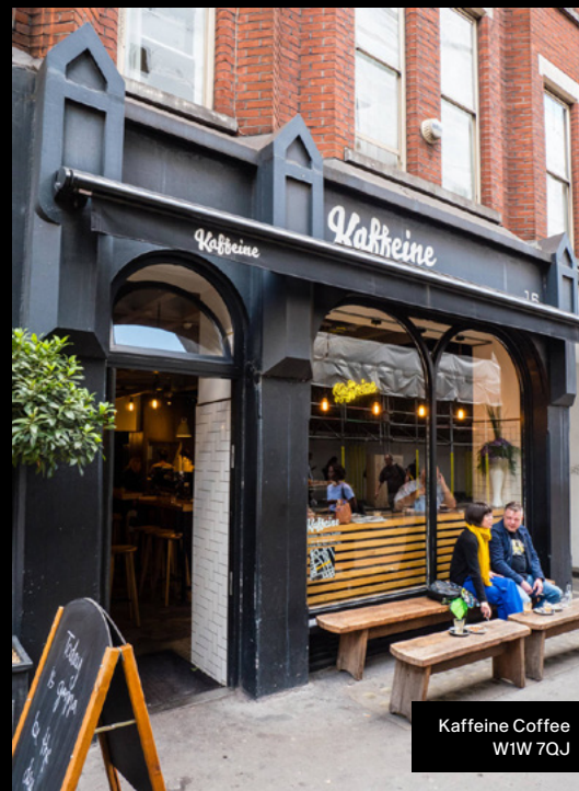
Kaffeine Coffee W1W 7QJ