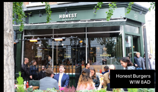
Honest Burgers W1W 8AD